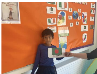
proud of being from Bangladesh