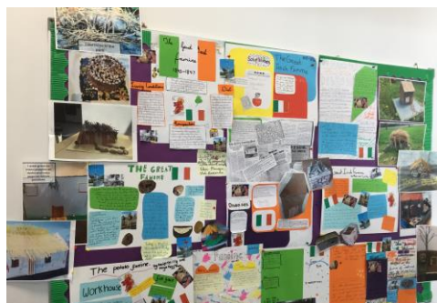
Display of project work for Intercultural Week

They are excited about the news that the class is having a fun day on the 16th of June where a magician will be coming in and they are all very excited about going into 2nd class later this year.