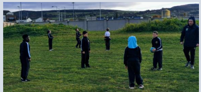
2 nd class enjoying GAA